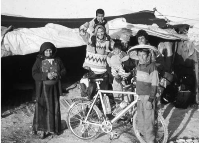
Jordan - with Bedouins in the desert

dhist background. By the time I made it to the European Unitarian churches in Czechoslovakia, Hungary, and Romania, my idea of how the guiding principles of this faith can be interpreted and lived out in different ways had been forged.