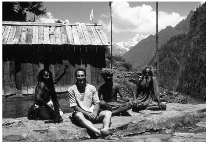
India - with Ascetics in the Himalayas

Hindu ashram where I lived and studied yoga and the sacred texts and techniques of Hinduism. One day in the midst of meditation, I felt my call to become a Unitarian Universalist minister. I had grown up in this faith, and I had been taught since childhood that Unitarian refers to the belief that all life originates from a single source and that Universalists believe that we are all heading toward a single destiny. The underlying sense of life's unity and the church's openness to learning from all faiths and cultures made it the right place for me to dedicate my efforts and share my knowledge and passion.